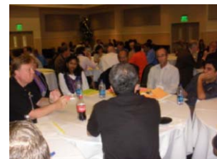
Biomass Group –