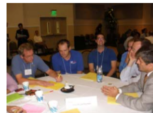
Solar PV: Thermal Group –