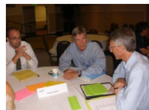
Carbon Capture Group –