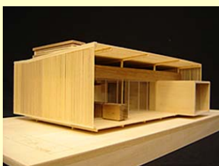
A conceptual model of Team Florida's Flex House.

levels are too high to achieve an acceptable comfort range in the house. Informed by FSEC studies that have shown that the majority of heat gain comes through the roof of Florida homes, the ZEHL employs a shading device that covers the entire roof and the east and west walls to reduce heat