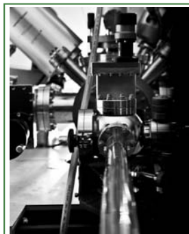
The thermo-chemical fuel project uses an ultra-high vacuum analytical tool which identifies the chemical species on the catalyst.

The testing moved up to bench scale, producing a liquid product with a yield in the diesel and jet fuel range. The fuel produced using this process is similar to those derived from petroleum unlike ethanol-derived fuels which have at least a 25% lower energy content. This is accomplished via fast chemical reactions unlike the slow biological reactions for fermenting alcohol, and the process does not require large amounts of water.