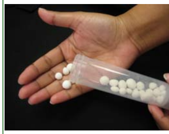
Phase change material pellets developed by Goswami's research team.

and demonstrating a thermal energy storage (TES) system based on materials that absorb heat when changing from a solid to a liquid and release heat when changing from a liquid to a solid. The objective is to create a TES system based on encapsulated phase change materials to meet the utility-scale base-load CSP plant requirements at much lower system costs