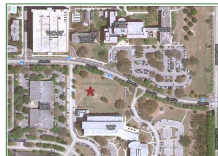
Park site between Alumni Dr. and Spectrum Blvd.

mean that no energy is used — it produces the same amount of energy that it uses. The energy produced is from RE; when it produces more energy than is needed that energy will be fed directly into the utility grid; and those times it produces less energy than it requires, energy will be drawn from battery storage devices or from the grid.