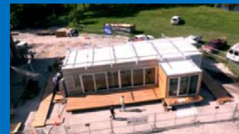
USF's Flex House during construction.

The University of Maryland took the overall trophy this year.