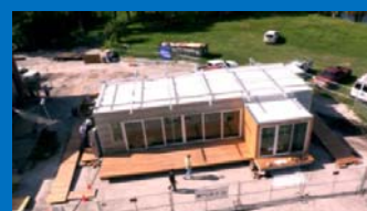
USF's Flex House during construction.

The University of Maryland took the overall trophy this year.